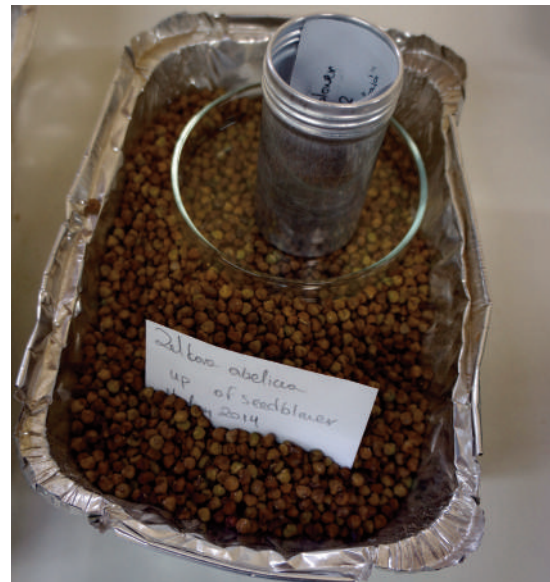
Seed collections for ex situ conservation of Z. abelicea at the Mediterranean Agronomic Institute of Chania, Crete.

Conventional measures of protection and management, including effective methods to limit and/or completely prevent livestock grazing and browsing should be implemented by means of fencing, and should comprise the entire range of the genetic diversity of the species. Such measures require to be developed in close collaboration with