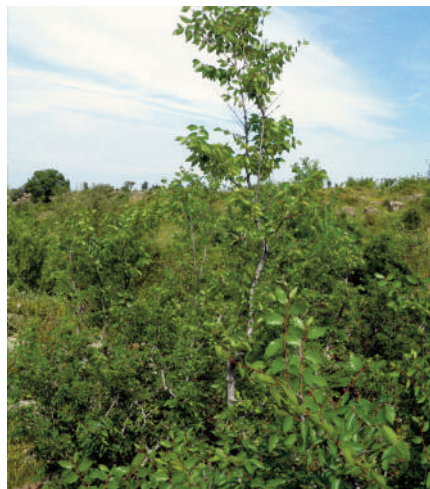
Z. sicula . Population of Ciranna, Sicily. (G. Garfi)

Within the genus, Z. sicula Di Pasq., Garfi & Quézel has a particularly remarkable position. Discovered in 1991 (Di Pasquale et al. , 1992), this narrow endemic is known from only two locations. Both populations cover an area of occupancy of less than one hectare and include a few hundred small trees each. Occurring between 350 and 450 m above sea level