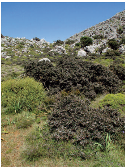
Isolated, shrub habit population of Z. abelicea in the Thripti Mountains, Eastern Crete. (G. Kozłowski)

Recent studies confirm however, that all populations are subject to threats from overgrazing and browsing (goats and sheep), as well as from soil erosion, drought and fires. As a result, all stands of Z. abelicea are dominated by dwarfed and heavily browsed individuals. This habit is especially pronounced in relatively small and isolated populations (e.g. in Thripti where there are no large trees at all). This is of great concern to conservation as only fully developed trees are able to flower and produce fruits (Fazan et al. , 2012; Kozłowski et al. , 2014). Z. abelicea has been included as Endangered (EN) on the IUCN Red List of Threatened Species.