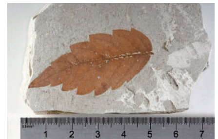
Zelkova zelkovifolia. Pliocene. Willershausen, Germany.

the Caenozoic Era (some 55 – 2.5 million BP). Fossil discoveries attributed to the genus, dating back more than 50 million years, give proof of the plant's once wider, circumboreal occurrence. Today the highly disjunct distribution of the six extant species – Z. sicula , Z. abelicea , Z. carpinifolia , Z. schneideriana , Z. sinica and Z. serrata – from the Mediterranean over to the Caucasus and East Asia, make this genus a fascinating subject for phylogenetic and biogeographic studies to advance the understanding of evolutionary processes.