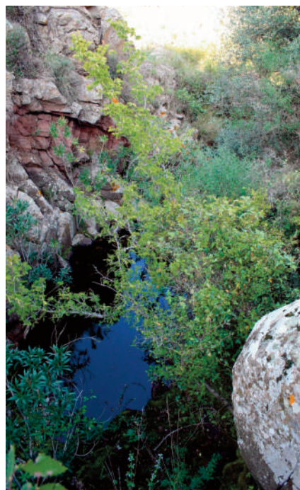
Z. sicula micro-habitat. (G. Garfi)

Several of the morphological and life traits of Z. sicula can be interpreted as the result of a long-lasting process of adaptation to a rather suboptimal environment. Unlike the other Zelkova species, Z. sicula is a shrub or a small tree. Characteristic for plants at the limit of their distribution range, this habit is most likely a response to water shortage in the current habitat. The location of both populations restricted to the bottom of gullies and along narrow streams, suggests that these micro-habitats play a key role in enabling the species to withstand drought. Nonetheless, extreme environmental hazards, such as prolonged drought can cause moderate to severe damage, ranging from withering of leaves to dieback of branches and stems. What is more, rising habitat fragmentation and livestock grazing represent major further threats to both populations. Due to its rarity, Z. sicula has been included as Critically Endangered (CR) on the IUCN Red List of Threatened Species.