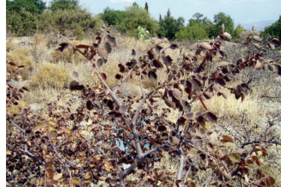
Z. sicula leaf withering.