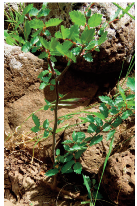
Young tree of Z. sicula developing by root suckering. (G. Garfi)

Recent studies (Christe et al. , 2014b) suggest that Z. sicula has been subject to severe isolation and genetic impoverishment. Fructification is irregular and seeds are most probably sterile due to its triploidy. Regeneration relies on vegetative mechanisms such as root suckering and layering; as a result, individuals in both genetically impoverished but distinct populations are assumed to be of clonal origin; hence, each population could be regarded as a single individual. This, in addition to the extended geographic isolation, has most likely caused a sharp decline in gene flow and a decrease in intra-specific genetic variability. On the other hand, clonality and vegetative reproduction are adding a further trait of uniqueness to this species in the genus Zelkova ; as with Lomatia tasmanica (Proteaceae) – known from a single, clonal population estimated to be several ten thousands of years old (Lynch et al. , 1998), each Z. sicula population could potentially represent a many thousand year-old genetic unit.