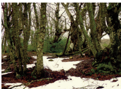
Bosco Pomieri, Madonie Mountains, 1340 masl, a potential introduction site.

Securing viable populations in situ nevertheless remains the main conservation challenge. Introduction to other ecosystems is being studied to establish further populations in new locations. These have been identified using the guidelines for 'assisted colonisation' (Brooker et al. , 2011), and build on paleo-ecological data and observations of specimens grown under different ex situ conditions which reveal the growth potential of Z. sicula into actual trees (Garfi et al. , 2011; Garfi and Buord, 2012). These findings suggest that more humid and cooler climatic conditions typical to montane mixed deciduous forests with Fagus , Acer , deciduous Quercus , etc. may offer a