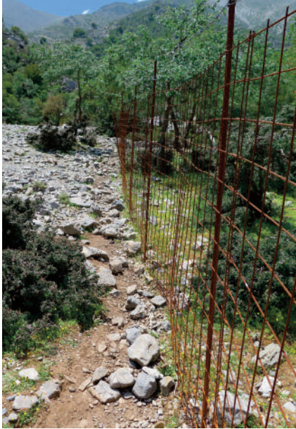
Fenced pilot sites with Z. abelicea . On the left: non-fenced and heavily grazed area. Xeropotamos, Crete. (M. Beffa)

outreach events have been realized, including scientific seminars, conferences and exhibitions, accompanied by a series of first-rate public outreach materials.