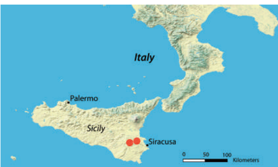
Distribution of Z. sicula (red colour). Map by Natural History Museum Fribourg, Switzerland

on the north-eastern slopes of the Iblei Mountains (south-eastern Sicily), the populations are found in open forest communities with other tree species such as Quercus suber , Q. virgiliana , Olea europaea var. sylvestris , Pyrus spinosa and Calicotome infesta .