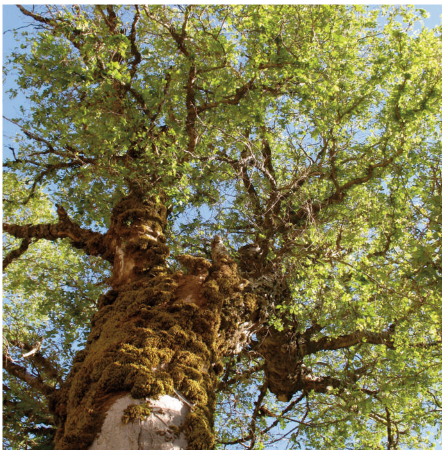
Z. abelicea , Omalos, Crete. (J. Gratzfeld)

Zelkova abelicea (Lam.) Boiss. is the only endemic tree of the east-Mediterranean island of Crete. The species is found in open, mountain forest communities