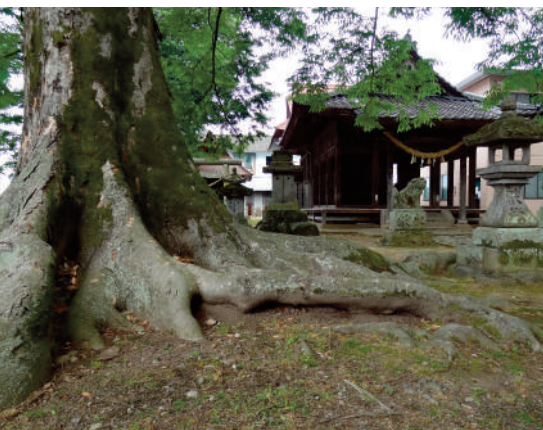
Zelkova serrata. Buddhist shrine, Hita, Japan.