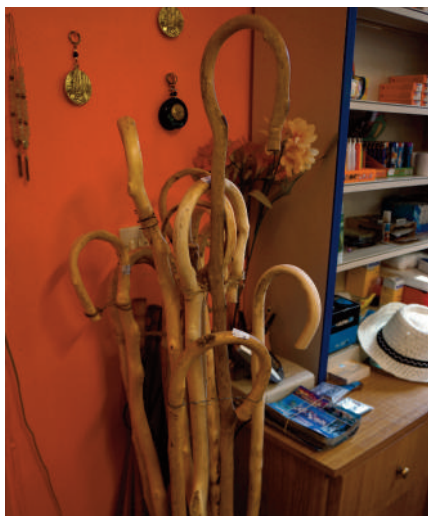
Shepherd's crooks ('Katsouna') made from Zelkova abelicea. Omalos, Crete.