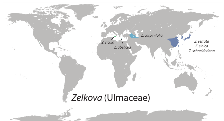
Global distribution of Zelkova spp. Map by Natural History Museum Fribourg, Switzerland