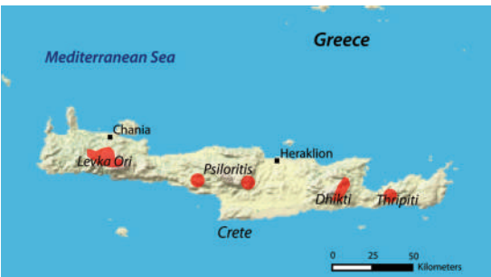
Distribution of Z. abelicea (red colour). Map by Natural History Museum Fribourg, Switzerland

before the arrival of man. To date, it is not resolved if the fragmented pattern of Z. abelicea populations is the result of anthropogenic habitat transformation or if its occurrence always consisted of a patchy distribution (Kozłowski et al. , 2014).